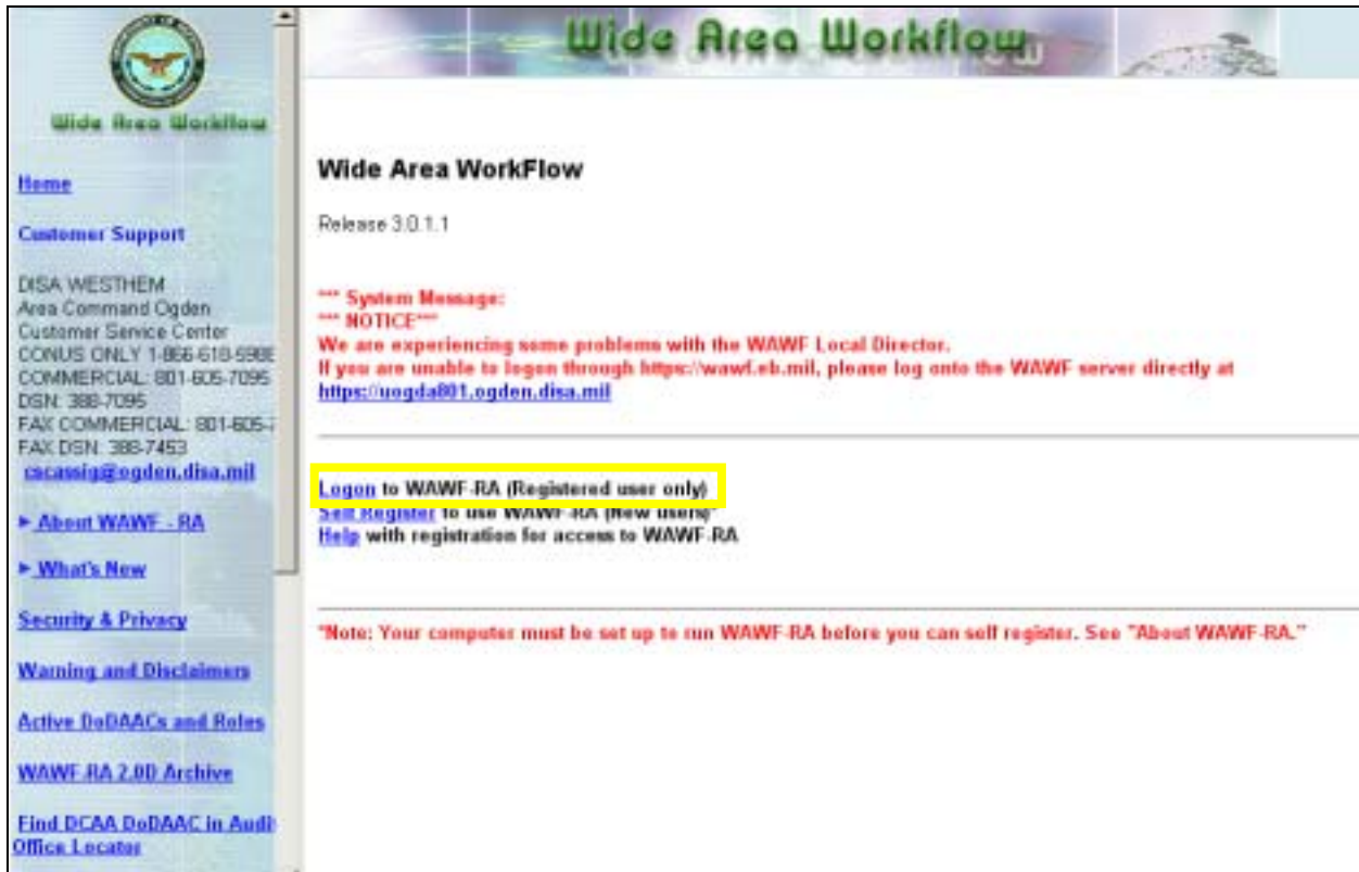
Figure 2. WAWF-RA Login Screen

From there, the EBPOC will log in to WAWF-RA (see Figure 2).