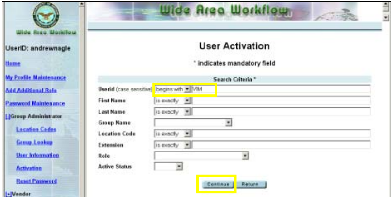
Figure 4. WAWF-RA User Search Screen

The GAM will search for the UserID that begins with “VIM” as illustrated in Figure 4 below.