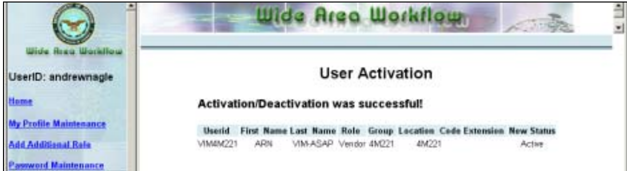
Figure 6. WAWF-RA Activation Results Screen

The Active Status should initially be “N”, meaning that this user is not able to access WAWF-RA. Checking the Change Status checkbox and clicking Submit will Activate our UserID and allow us to transmit your data from VIM-ASAP to WAWF-RA. You should see a screen like Figure 6 below indicating that the VIMxxxxx UserID has a New Status of “Active,” and a message indicating that the “Activation/Deactivation was successful!” VIM-ASAP is now able to submit your DD250 data to WAWF-RA for your QAR’s approval and subsequent submission to DFAS for payment.