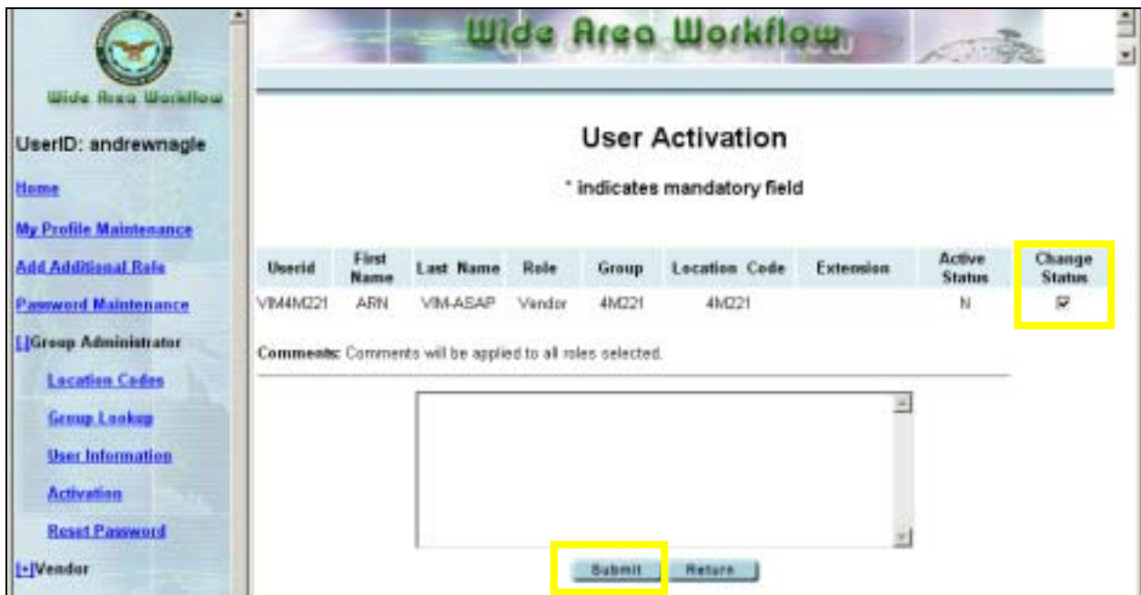
Figure 5. WAWF-RA User Activation Screen

Clicking on the “Continue” button will bring up the User Activation screen (Figure 5) listing the VIM user (“VIMxxxxx”) that we created, as listed in your Email.